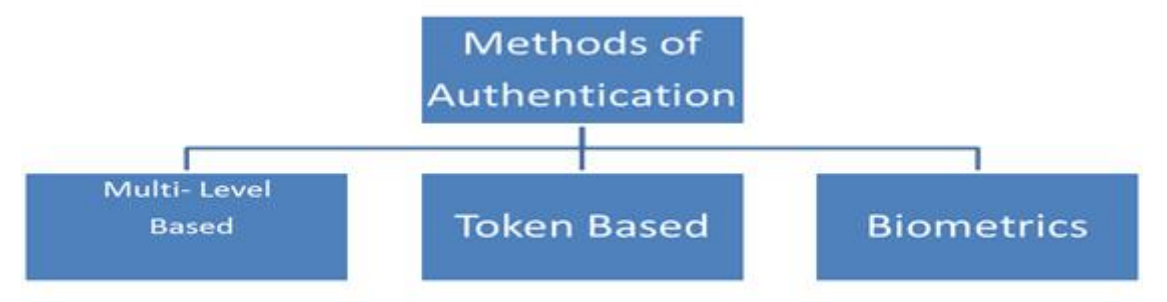
Fig.1 Classification of Authentication Methods